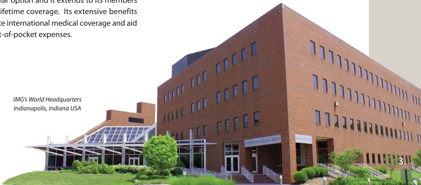
IMG's World Headquarters Indianapolis, Indiana USA

This option provides the superior benefits package for the most discerning global consumer. Platinum offers enhanced benefits and services with $8,000,000 of lifetime coverage. It is designed for the client who wants the convenience of comprehensive medical, dental, and vision benefits in one plan. The elite Platinum option also offers members access to our exclusive Global Concierge and Assistance Services SM (see page 5).