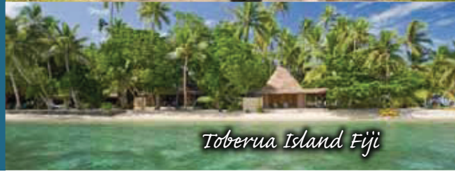
Toberua Island Fiji