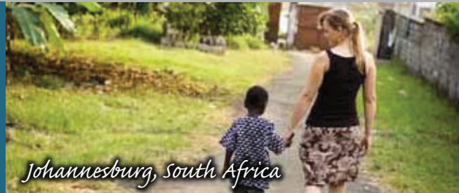
Johannesburg, South Africa

With medical coverage from 5 days to 12 months, Day Tripper Group Travel from HCC Medical Insurance Services (HCCMIS) is with you almost anywhere on the planet you may travel with a group of 5 or more for mission trips, large family vacations, student groups abroad, corporate groups, and overseas excursions for other large organizations.